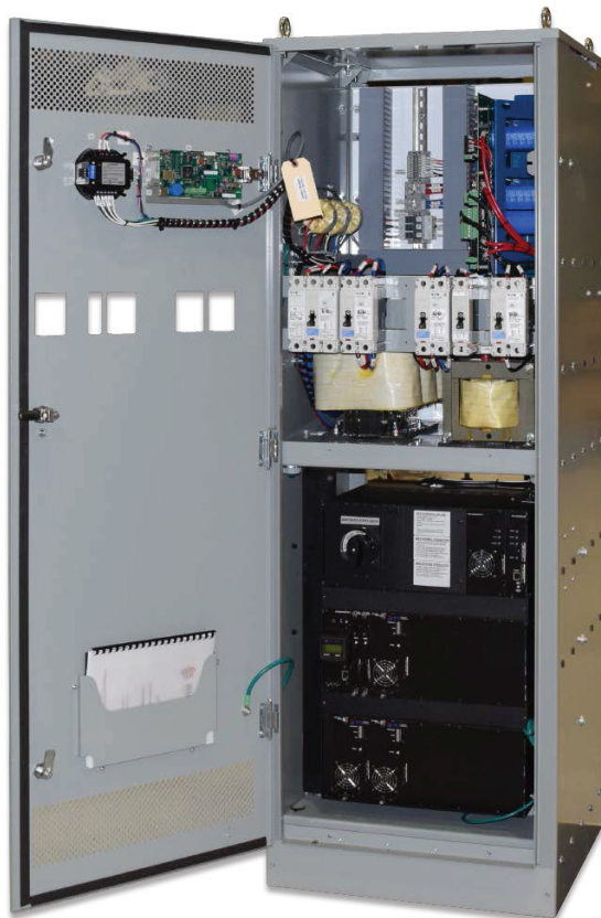
System providing 3KW AC and DC 6.25KW DC