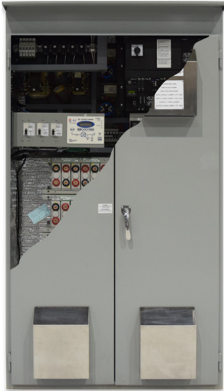
NEMA 3R charger fitted with double doors and rain hoods over vents. Integrated battery rack w/ 20 yr. VRLA batteries.