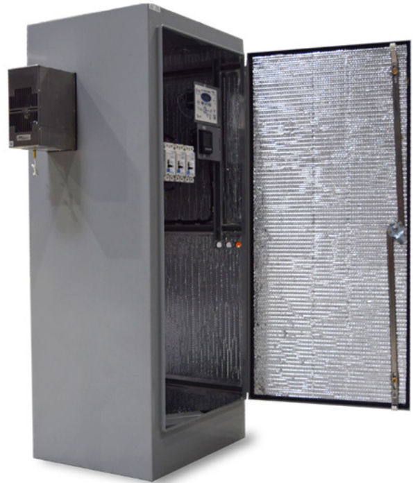
NEMA 4 marine type, fully insulated SB7 charger with a heater, air conditioning and an integrated battery rack.