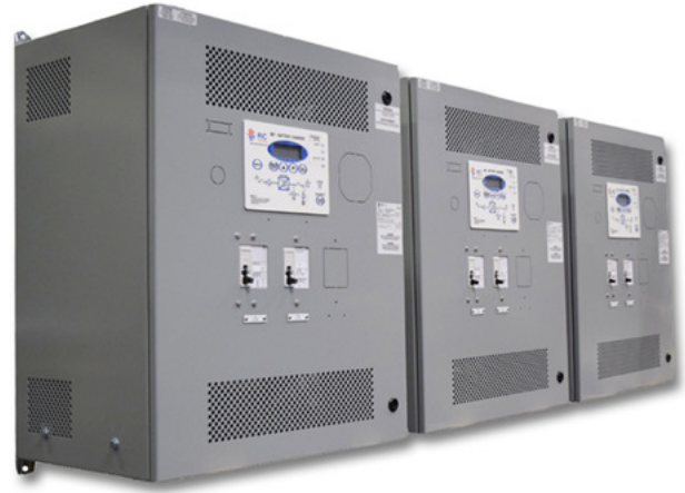
Wall mount enclosure - 30"H x 24"W x 16"D